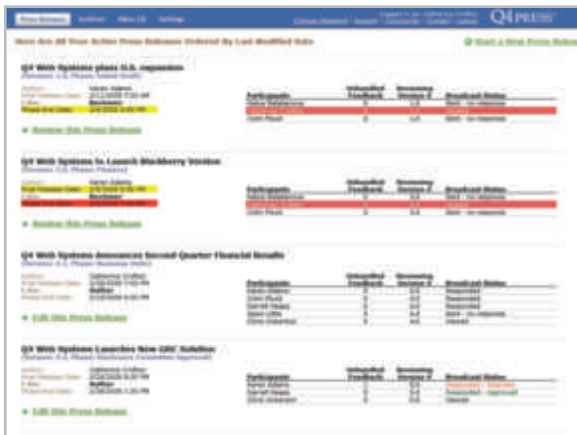
View real-time status of documents and activity